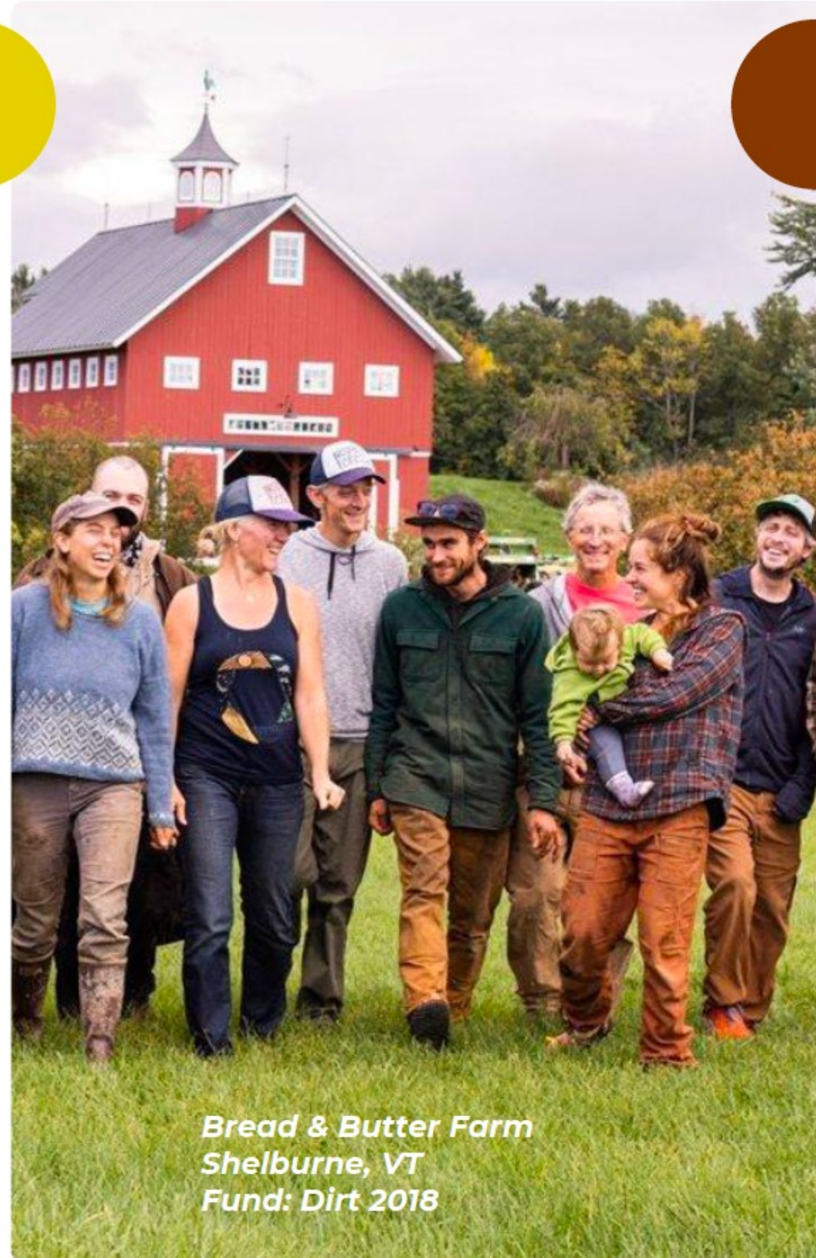
Bread & Butter Farm Shelburne, VT Fund: Dirt 2018