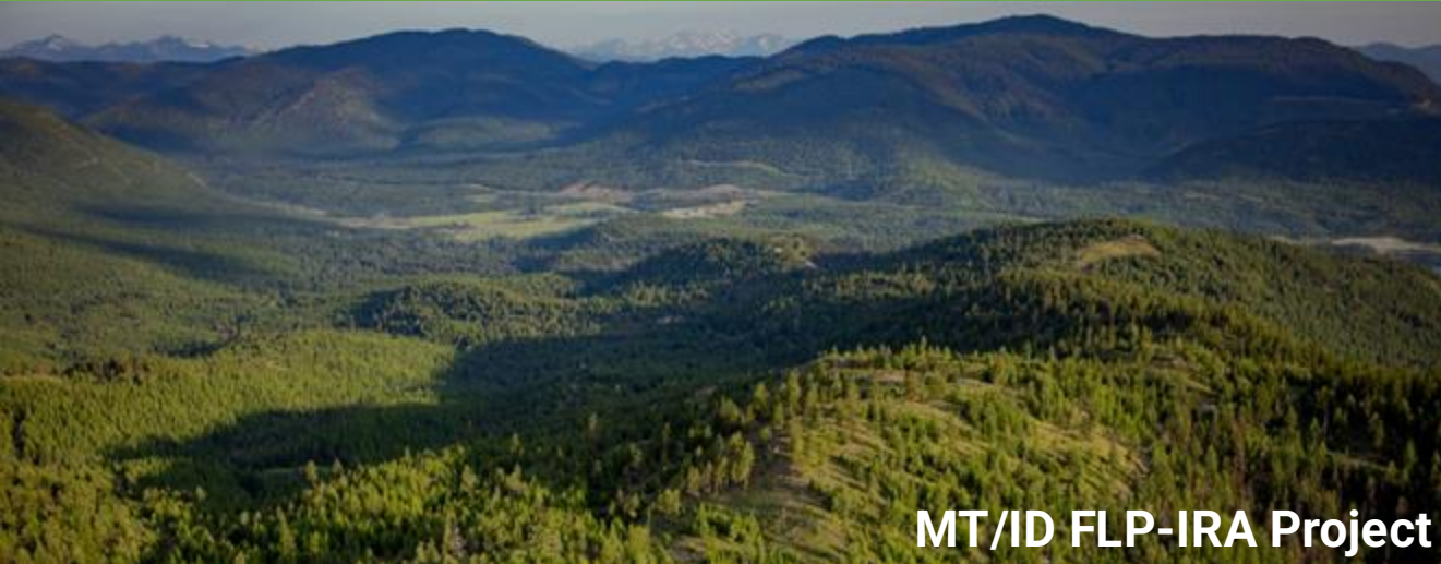
MT/ID FLP-IRA Project