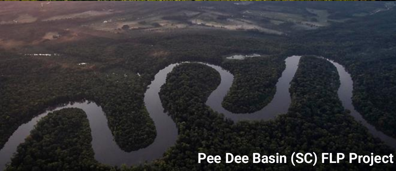
Pee Dee Basin (SC) FLP Project